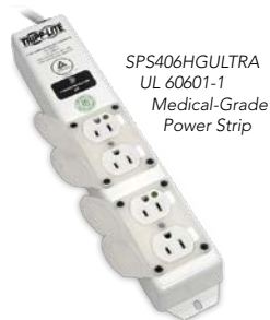
SPS406HGULTRA UL 60601-1 Medical-Grade Power Strip